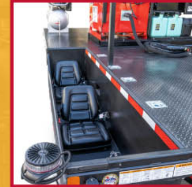
Dual-side tandem seating supports simultaneous dispensing and marker application