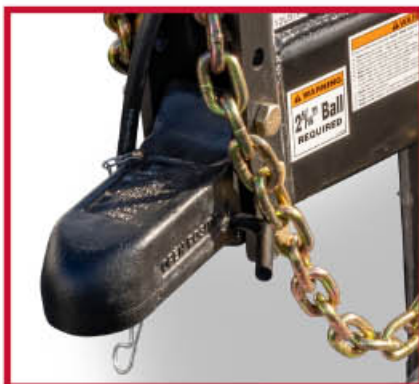
Choose from pintle or 2-5/16" ball hitch