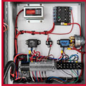
Digital over-temperature safety cut-off circuit