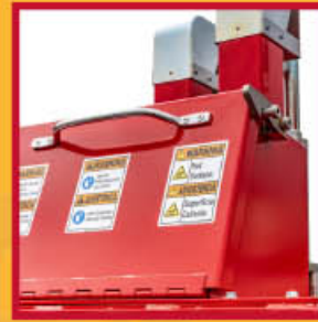
Large loading door with stainless steel safety latch