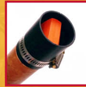
Elastomeric anti-drip duckbill valve with guard

Designed, fabricated, and assembled in the USA