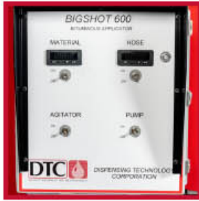
Digital readout temperature control for hose and wand