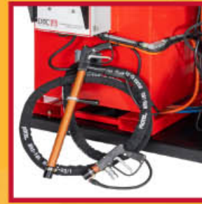
Choice of 10- or 15-foot heated hose, and 4- or 24-inch electrically-heated wand, with duckbill valve