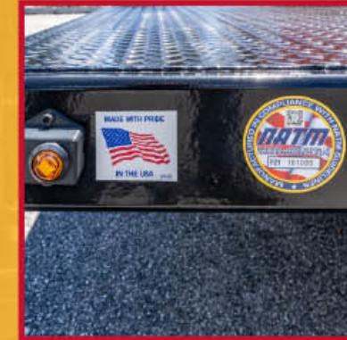
All trailers certified by the National Association of Trailer Manufacturers to meet all DOT and SAE rules & regulations for over-the-road trailers