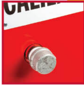
1-1/4" Material drain port