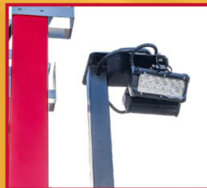
Optional Title 13 beacons and work lights are available