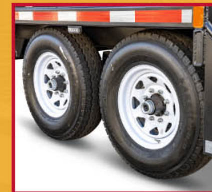
Trailer-rated tires built to handle heavy loads and rough conditions