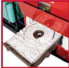
Stainless steel burner tray slides out for ease of service