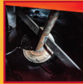
Hydraulic powered full sweep dual blade agitator with auger