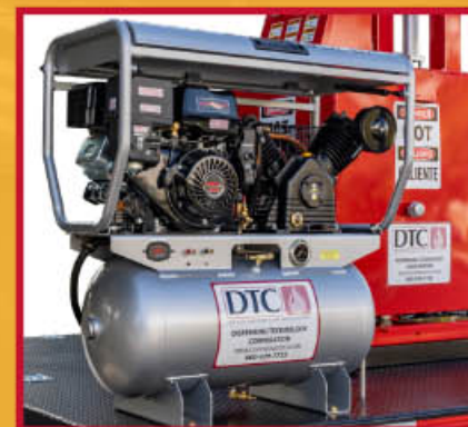
Optional onboard compressor delivers consistent air supply