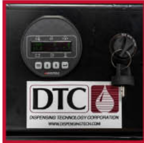
Electronic ignition with digital temperature readout