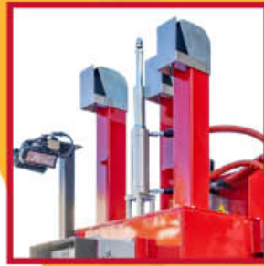
Rain and wind caps