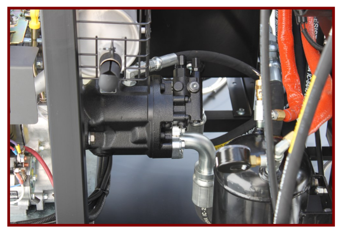
EFFICIENT PRESSURE COMPENSATED HYD PUMP