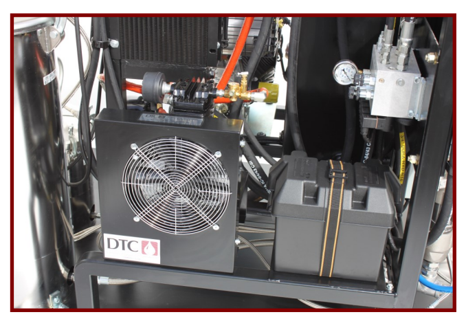
HYDRAULICALLY OPERATED AIR COMPRESSOR