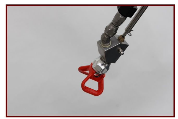
MIXED MATERIAL IN MIXER AND MANIFOLD ONLY

KOLDSPRAY GUN WITH INTEGRATED STATIC MIXER