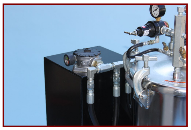
HYDRAULIC TANK WITH SIGHT GUAGE AND FILTER