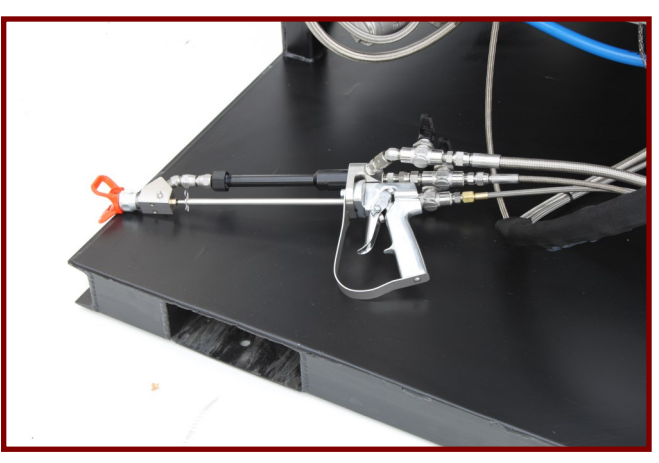
KOLDSPAY GUN WITH 35 FEET OF HOSES