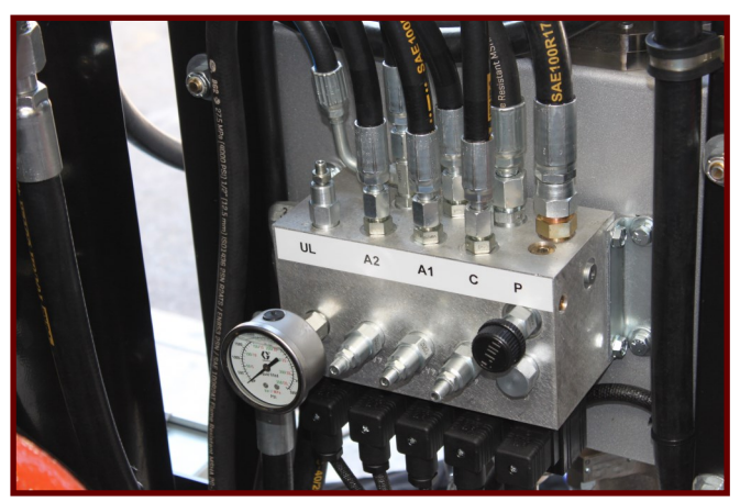
INTEGRATED HYDRAULIC MANIFOLD

STAINLESS STEEL CATALYST PUMP WITH OVER AND UN-DER PRESSURE CONTROLS