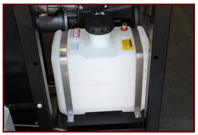
6.5 GAL FUEL TANK