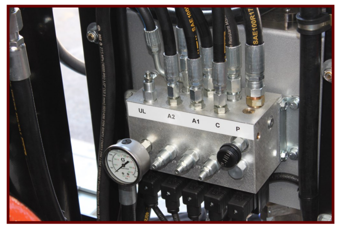
INTEGRATED HYDRAULIC MANIFOLD

INTEGRATED MANIFOLD WITH OVERPRESSURE VALVES