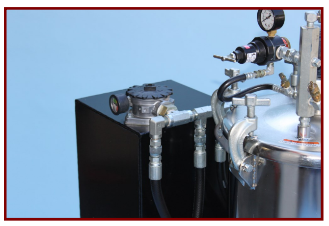
HYDRAULIC TANK WITH SIGHT GUAGE AND FILTER