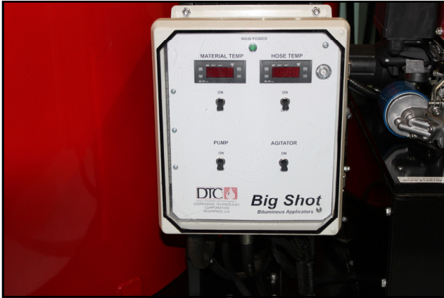
Digital electronic temperature controls provide precise control for the material and the wand