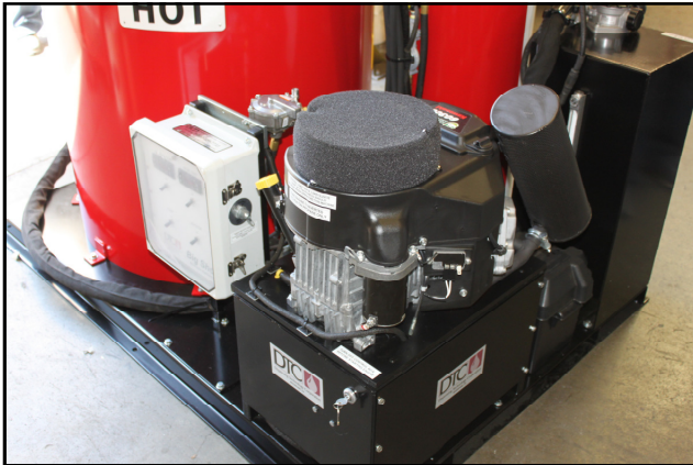
18 horsepower Kawasaki engine is converted to run on propane fuel Regulator and safety shutoff are provided