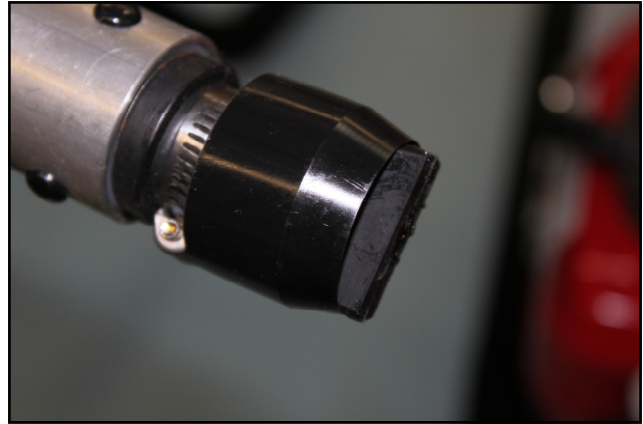
High temperature silicone duckbill valve with guard minimizes dripping between shots of material