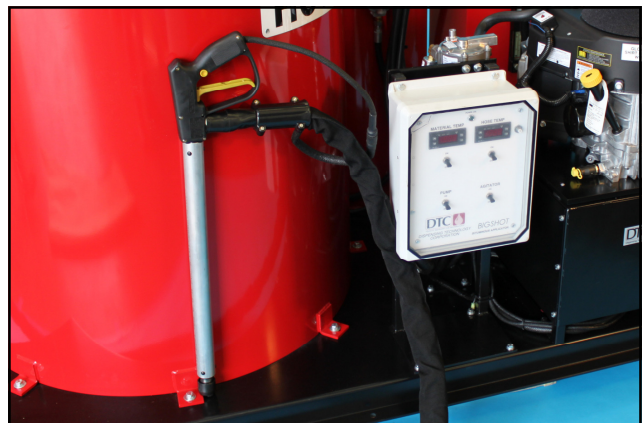
Lightweight ergonomically designed dispense wand with electric trigger switch Trigger lock prevents pump from operating when set